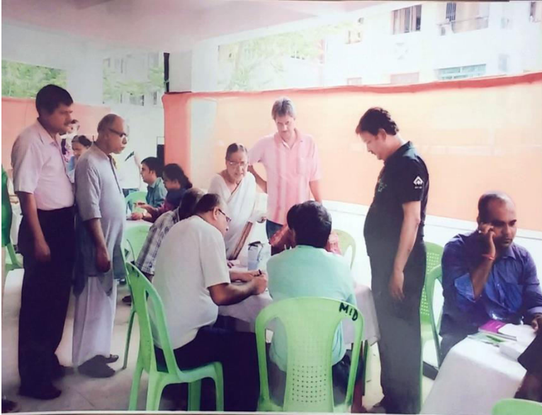
Photo record from album