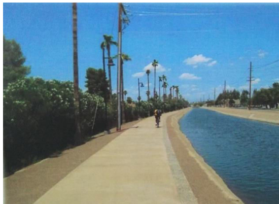
Canal view in perspective after proposed renovation