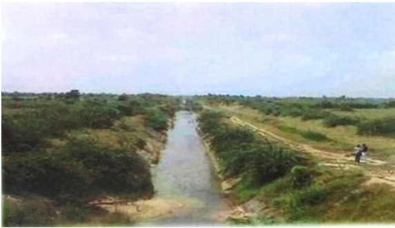
Canal view as exists now