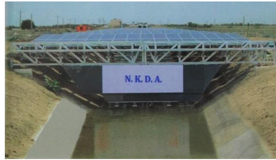
Canal view with proposed canal-top solar project